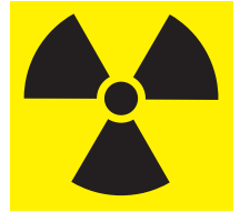
Radiation symbol on ionisation type smoke alarms

Will I hear my smoke alarm if I am affected by alcohol, drugs or medication?